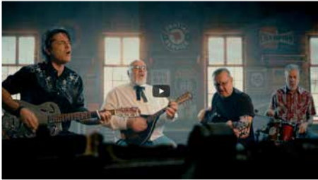
Shine (Collective Soul Cover) Click image to watch

Click on a thumbnail image to watch the video