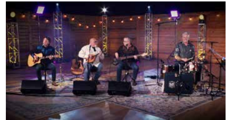
Galway Girl (LIVE) Click image to watch