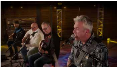
Pump up the Jam (LIVE) Click image to watch

Click on a thumbnail image to watch the video