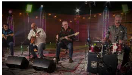
High & Dry (LIVE) Click image to watch