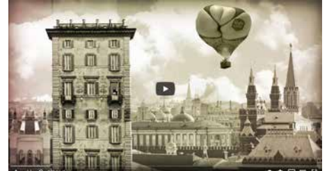
Rasputin (Boney M Cover) Click image to watch

Click on a thumbnail image to watch the video