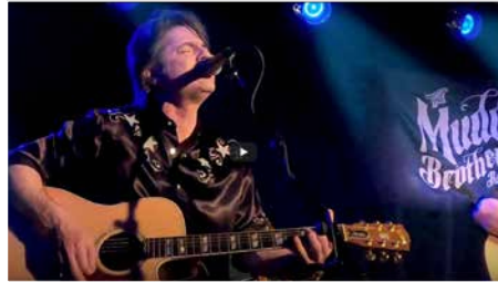
Last Dance for Mary Jane (LIVE) Click image to watch